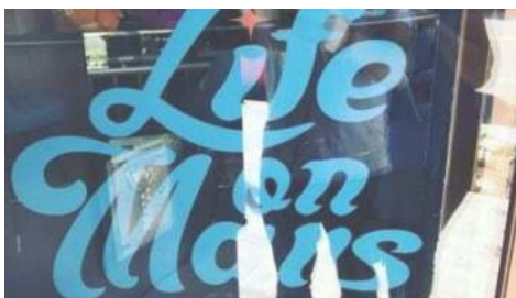
Life on Mars -- Capitol Hill's most anticipated plant-based DJ vinyl bar of