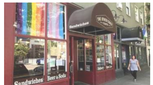
La Dive bar to bring natural wines and frozen wine cocktails to the 'grown-up'