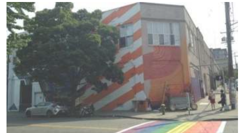
Massive 'Read up, Hands down' mural rises at 12th/Pine's Richmark Label building

Wednesday, August 24, 2016 - 3:53 pm In "News, etc."