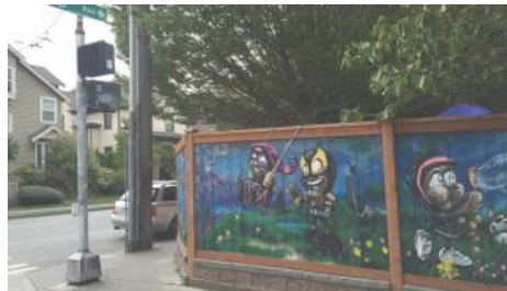
CHS Pics | A summer of murals across Capitol Hill

Saturday, September 19, 2015 - 4:46 pm In "News, etc."